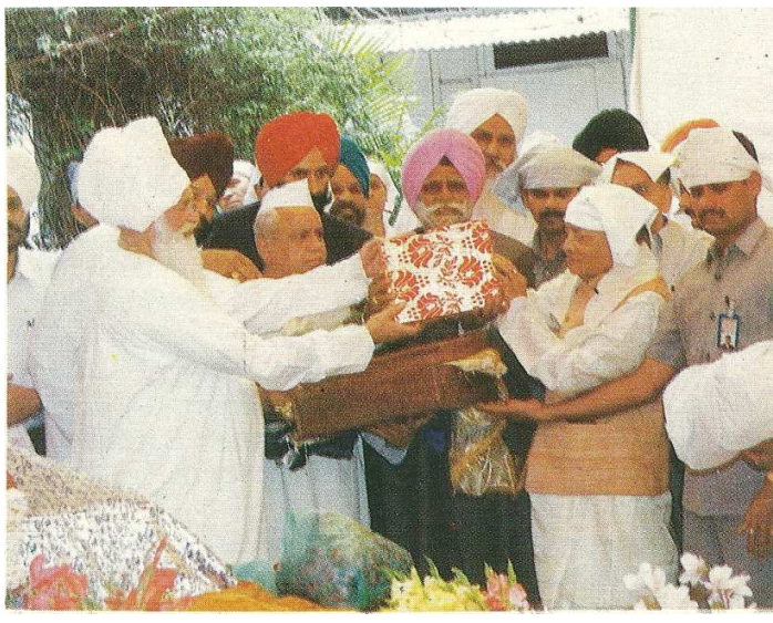
Babaji presents Guru Granth Sahib to Prime Minister Rao