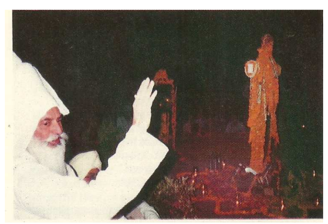
Babaji speaks of many prophets at Jesus's Place